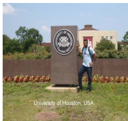
University of Houston