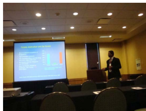
Presenting my research paper

The objectives of the ICEST-2012 is to provide a major interdisciplinary forum for presenting new approach from relevant areas of environmental sciences and to foster integration of the latest developments in scientific research. As a young scientist's, it was a great opportunity for me to share my ideas with the leading scientists' of the world. The conference has 600 presentations (oral + posters) under the 16 major themes. I was very happy that my paper was selected for oral presentation under the theme of society and environment, in which most of the presenters came from USA and other developed world.